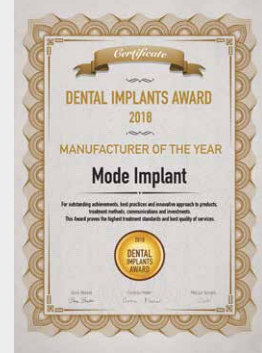
"THE MANUFACTURER OF THE YEAR" AWARD FROM USA 2018