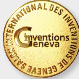
GOLD MEDAL RESEARCH AND INNOVATION AWARD GENEVA SWITZERLAND 2017